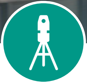
The Fehmarn Belt Fixed Link