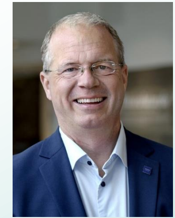
Martin Lundstedt CEO Volvo Group

"We need to work together in order to achieve this vision. It would be competitive advantage"