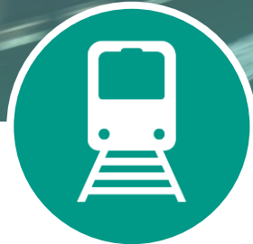
Göteborg – Oslo